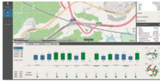
Some of its many innovations include a user-friendly interface, powerful and documented API, and intuitive automation tools.