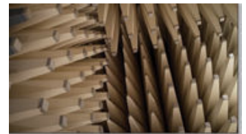
From single test benches up to complex multi-antenna test systems, multiple configurations are available to adapt to your needs.