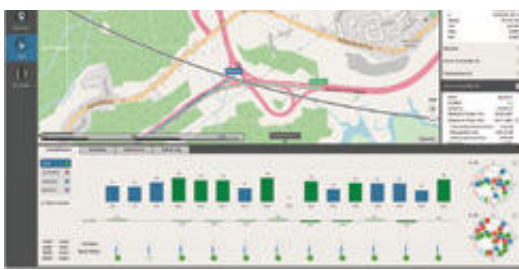
Some of its many innovations include a user-friendly interface, powerful and documented API, and intuitive automation tools.